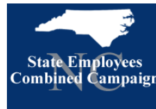
North Carolina State Employees Combined Campaign #2931