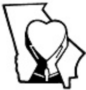
Georgia State Charitable Contributions Program #197031