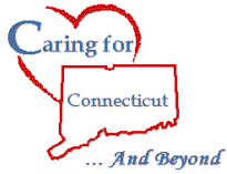
Connecticut State Employees Campaign #7711